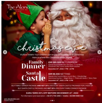
Picture 2. The Detailed Christmas Package Offer

wander the earth during Christmas to spread the goodness. Those sentences implies that people will feel happiness after they taste the sweet-sour beverage.