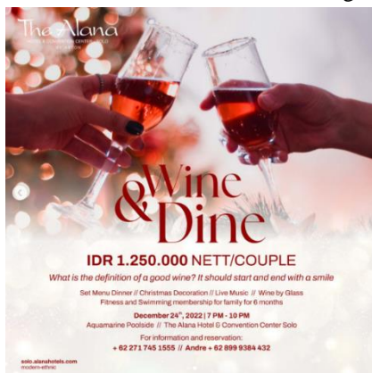
Picture 1. The Detailed Dinner Package Offer

Directive function basically aims to influence someone else’s behavior or action. This copywriting explicitly shows that Alana Hotel requests for the customer to book a seat at its restaurant. This request is shown in the statement “WhatsApp us on +62271 745 1555” so that the customer can find the information and make a reservation through this number. However, it begins with the informational statement before it makes a request statement.